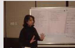
Attendees from 67 countries